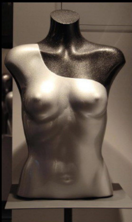
Mod.: 149/A + Silver Bustier