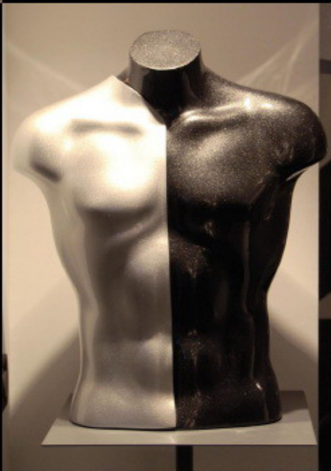
Mod.: 043/D + Silver Bustier