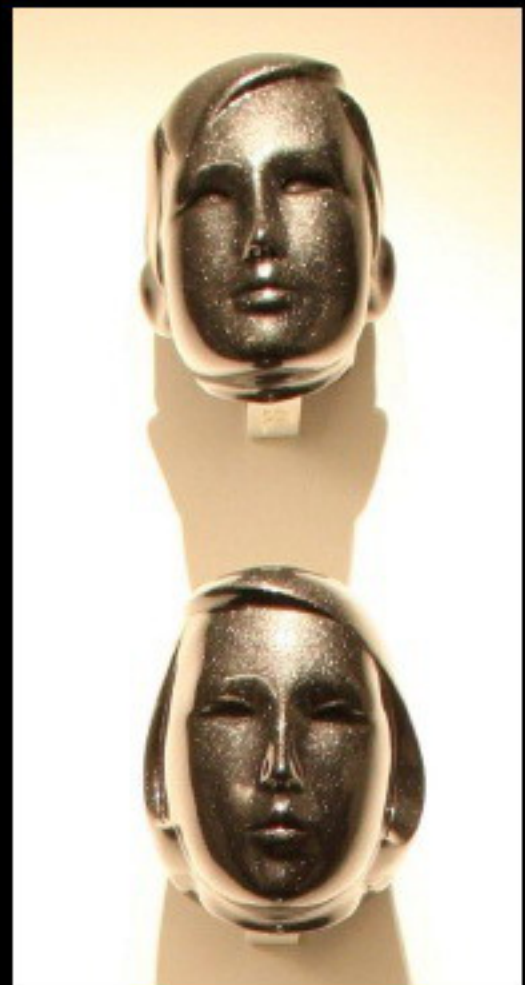
Head: H. 128 Col.: SAT 15 Glossy