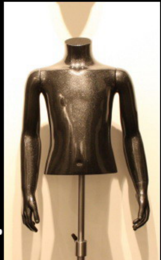
Mod.: 1350 S.T. (5/A)