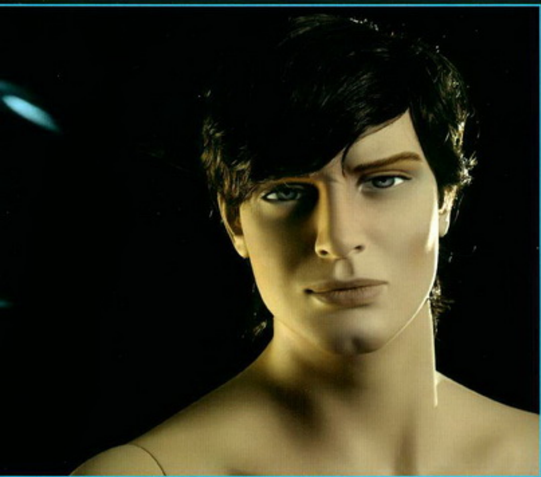
560 Make up: U.148 Wig: NWM.373