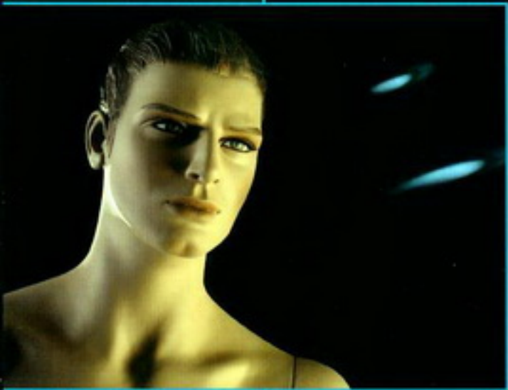
S.237 Make up: SH.283